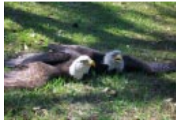
The worn-out eagles

“If my people, who are called by My Name, will humble themselves and pray and seek My Face, and turn from their wicked ways, then will I hear from heaven and will forgive their sin and will heal their land.” 2 Chron 7:14