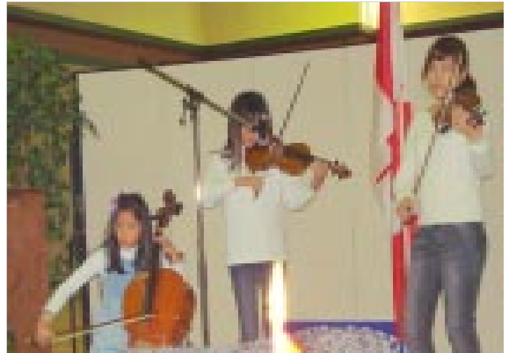
These Korean young ladies, with their mother, played at our Surrey Prayer Breakfast. Their God-given talents blessed us all.

We don't know how long we may have here, but until He calls us home let us continue to labour on in preaching the Gospel. Our Lord said it best before He ascended into Heaven, “Go ye into all the world and teach the gospel to every creature. He that believeth and is baptized shall be saved; but he that believeth not shall be damned” . □